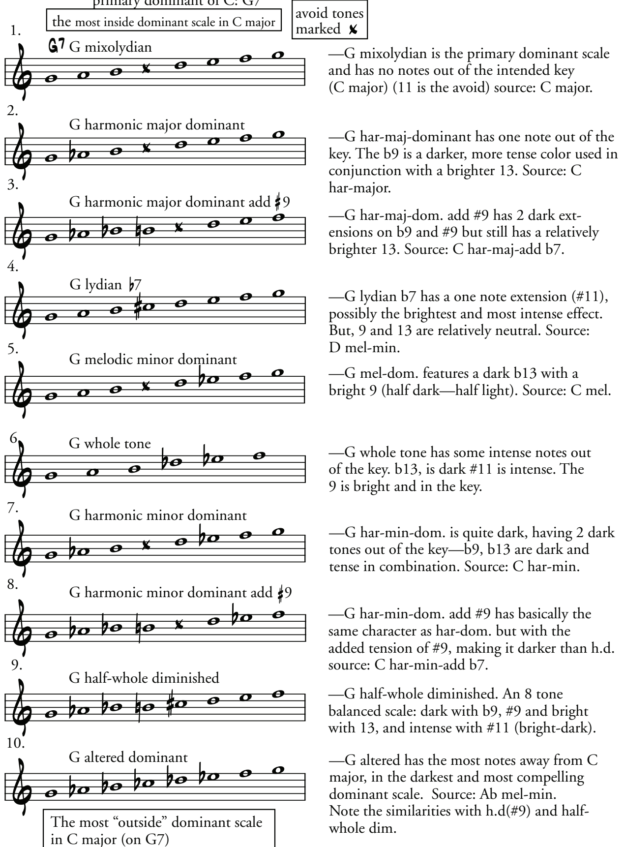
figure 32-3 A proposal of inside-the-key to outside-the-key order of dominant scales for the primary dominant of C: G7